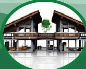
Building Your Dream House